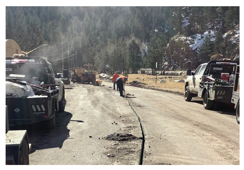
Big Thompson Canyon Micro Trenching