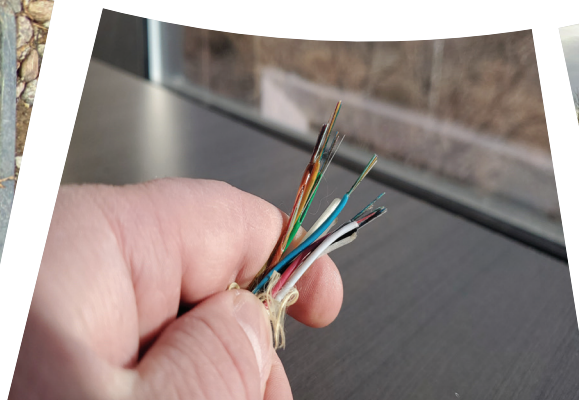
96 Count Fiber Optic Cable