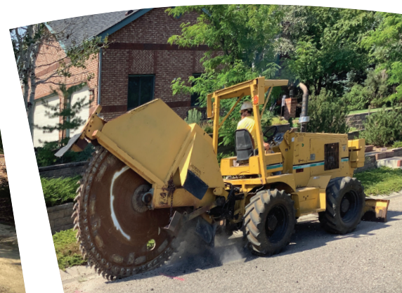
Rock Saw, trenching in rock