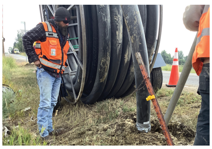
Installing railroad crossing casing pipe