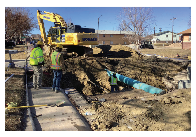
Pulse and Stormwater Project Coordination