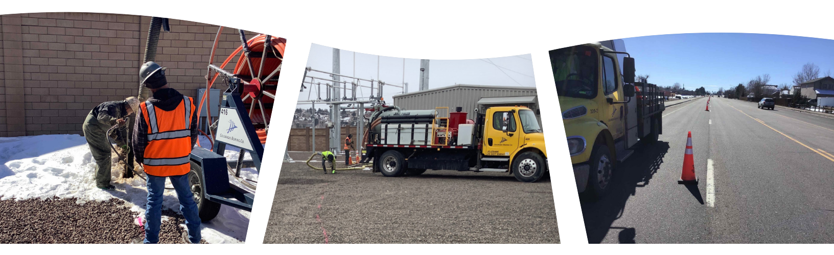
Horseshoe Substation - Hydro Boring

*Reported through: November 25, 2019 – February 29, 2020 ¹Includes costs accrued for installation of active network equipment at huts